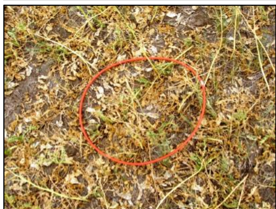
Two of the six monocultures on July 31

Monocultures of • Oilseed Radish • Purple top turnip • Pasja turnip • Soybean • Cowpea • Lupin were nowhere near as successful as the mix of all 6